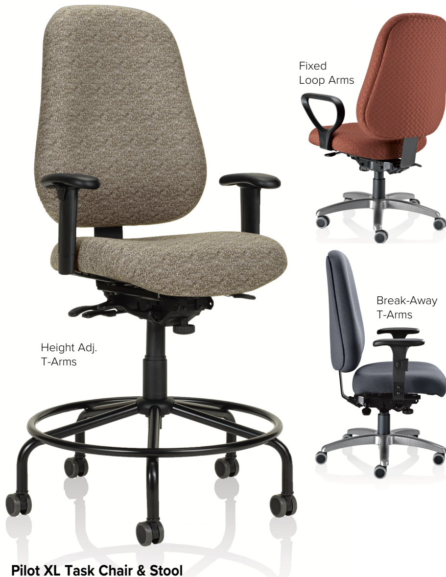
Fixed Loop Arms