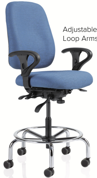
Adjustable Loop Arms