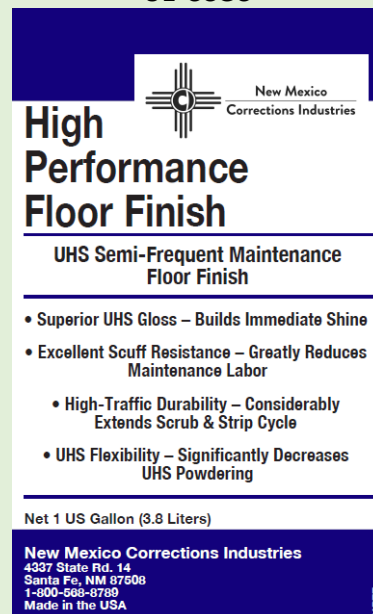
High Performance Floor Finish 51-CHPFF