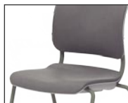
Seat and Back