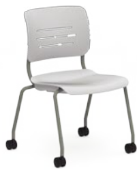
4-Leg with Casters