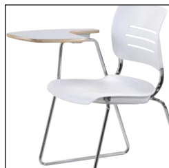
Oversized tablet arms provide ample space for a notebook, laptop or tablet on its 23" x 16¼" surface.