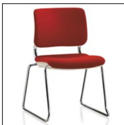
Fully upholstered and upholstered seat options add 1" of molded foam and endless fabric choices to Sitka's appeal.