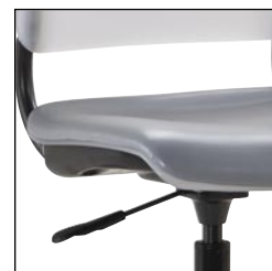
Height adjustments over a full 5" range are accomplished by a paddle located beneath the seat.