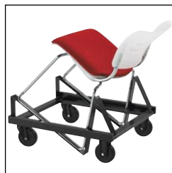
A transport dolly allows you to move 12 poly or 6 upholstered Sitka Sled Base or 4-Leg Stack Chairs at a time.