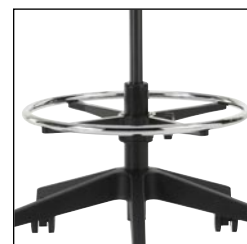
The adjustable foot ring makes the Sitka Task Stool as comfortable and ergonomic as the Task Chair.