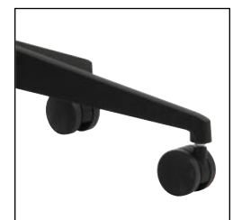
Casters can be specified with a soft or hard wheel surface for optimal mobility on any floor surface.