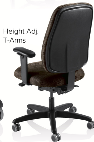
Height Adj. T-Arms