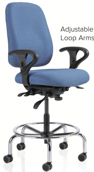
Adjustable Loop Arms