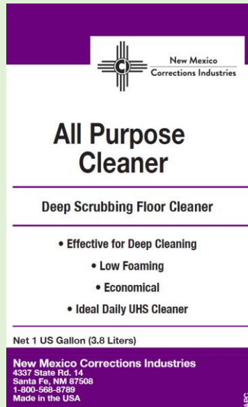
All Purpose Cleaner 51-CAPC