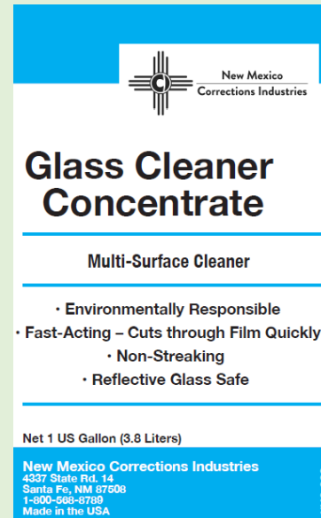
Glass cleaner Concentrate 51-CCGC