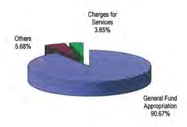
Figure A-1 Sources of Revenues for Fiscal Year 2014

Changes in Net Position: The Department's change in net position for fiscal year 2014 decreased by $9,111,298. (See Table A-2). A significant portion, 90.67%, of the Department's revenue comes from State General Fund Appropriations, 3.65% comes from charges for services, and 5.68% comes from other revenue sources. (See figure A-1).